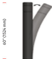
7" Reflex Bollard BG-REFLEXASSEMBLY7-XXX-60